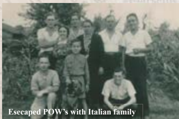
Escaped POW's with Italian family

The four month trek across northern Italy in search of freedom.